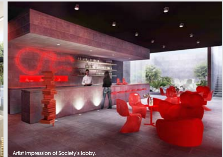
Artist impression of Society's lobby.

The cinema box office and café is proposed to be located next to Society's entrance.