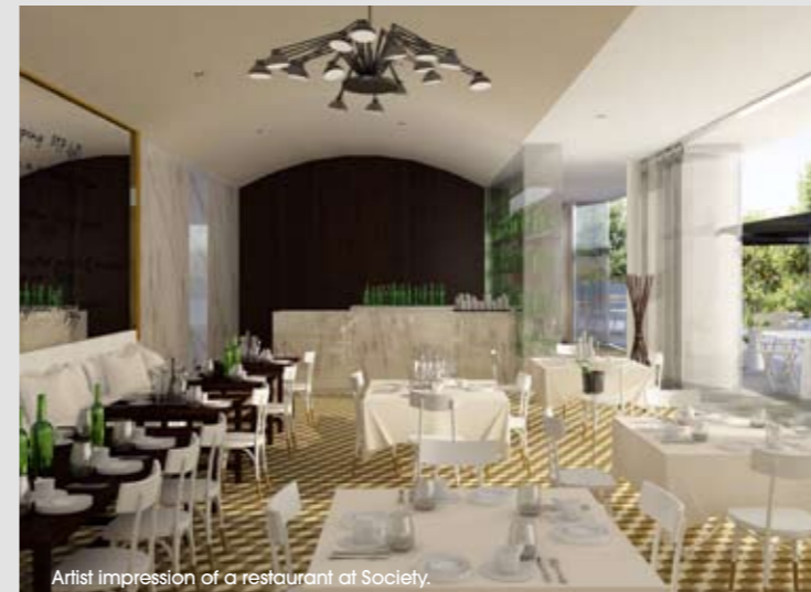
Artist impression of a restaurant at Society.

Solid rental enquiry on Society suggests the undersupplied inner city market is in need of the type of stock offered at Society. ■