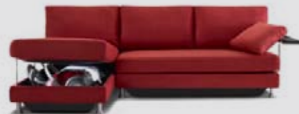
Sofa with storage space from King Furniture.

Furnishings - When selecting furniture for your compact space choose smaller pieces that have a more open design or dual use - eg a sofa which can double as a bed. Furniture for compact homes including furniture with inbuilt storage can be purchased at a number of furniture retailers including King Furniture, Rise+Shine and Gainsville.