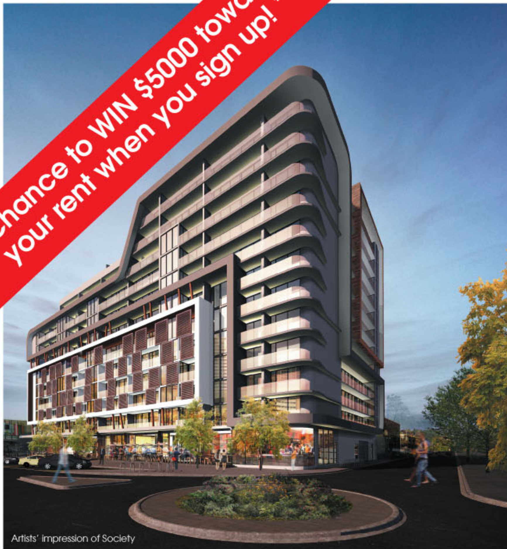
Artists' Impression of Society

Chance to WIN $5000 towards your rent when you sign up! *