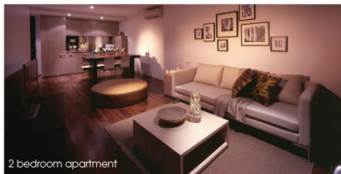
2 bedroom apartment