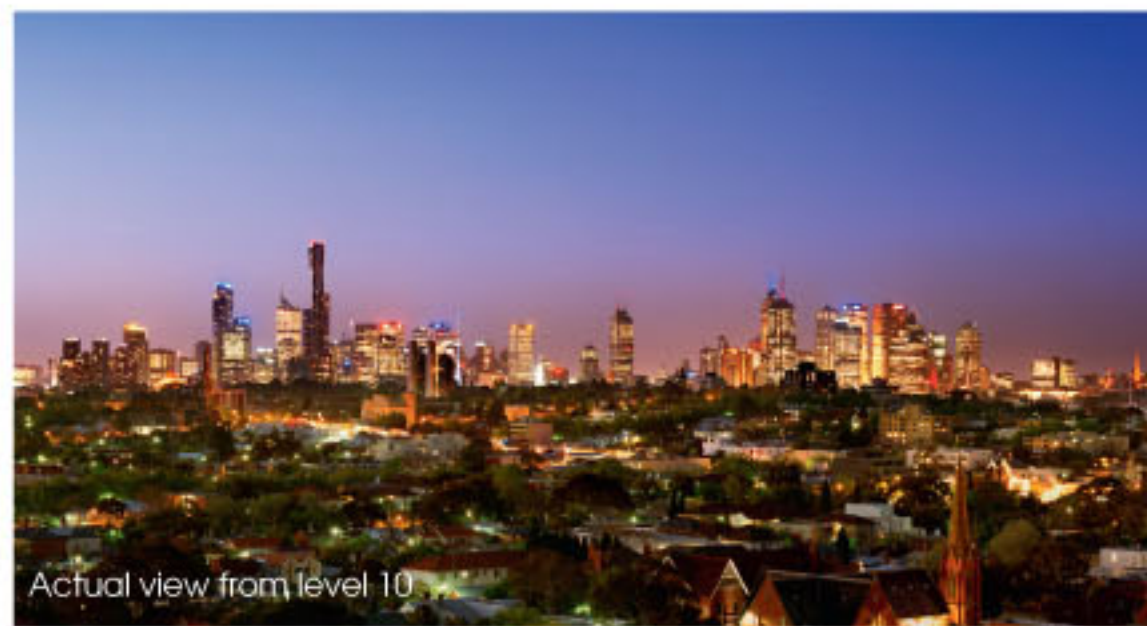
Actual view from level 10